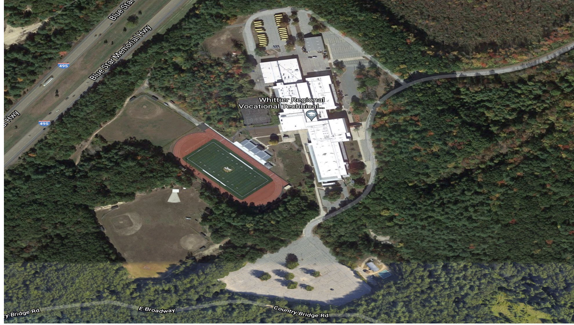
Whittier Regional Vocational Technical...